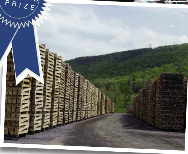
you see a German stack of untreated ties drying in the shadow of the Shenandoah Mountains.