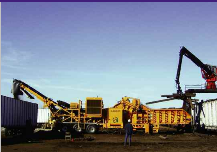
See page 9 for details.